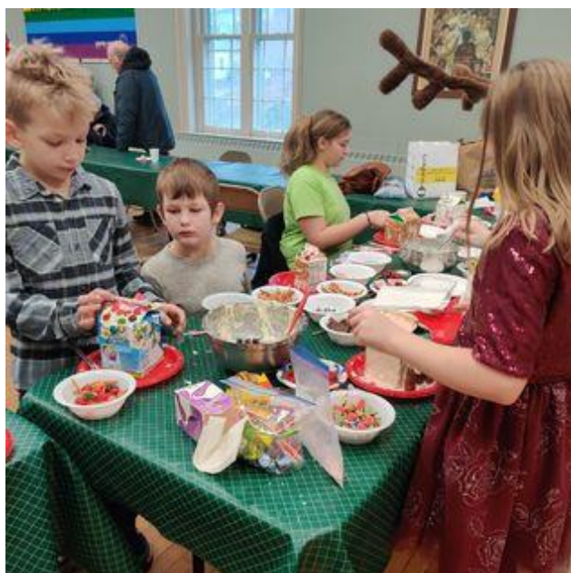
Making Gingerbread Houses