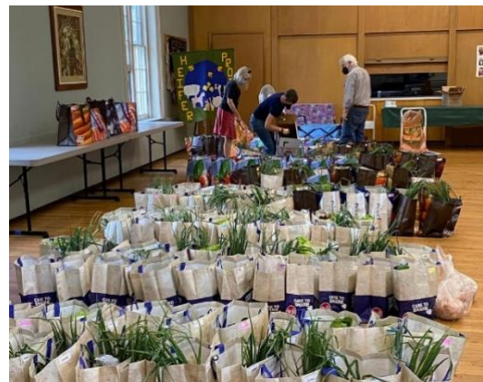
MULTICULTURAL BRIDGE FOOD DISTRIBUTION