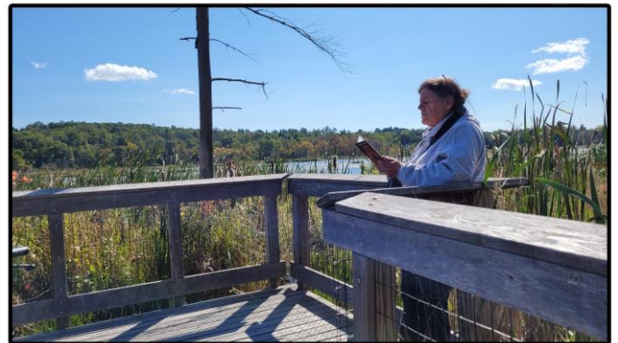
Sharing a prayer